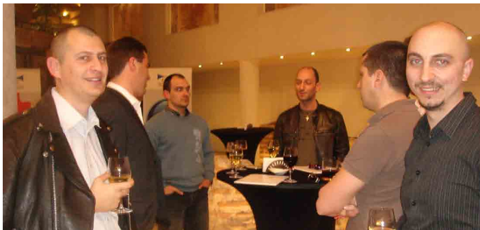
Top Class entrepreneurs celebrate their graduation, Bulgaria.